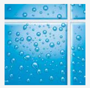
Water drops form ...