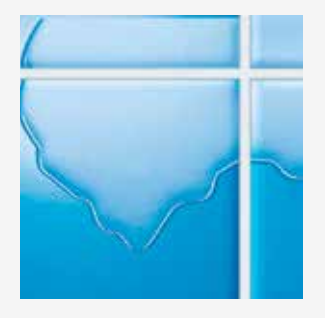
The water spreads as a thin film on the surface and lifts dirt form the surface ...