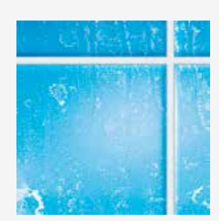
... and dirt is left on the surface after drying.